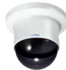
WV-QCD100G-W Dome Cover