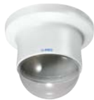
WV-QCD100C-W Dome Cover