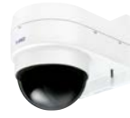
WV-QWD100G-W Wall Mount Bracket