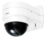
WV-QWD100C-W Wall Mount Bracket